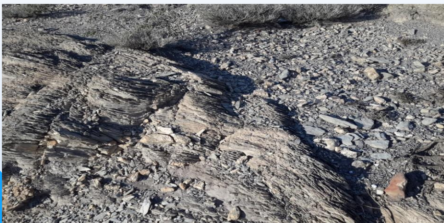
Shale Gas resource system