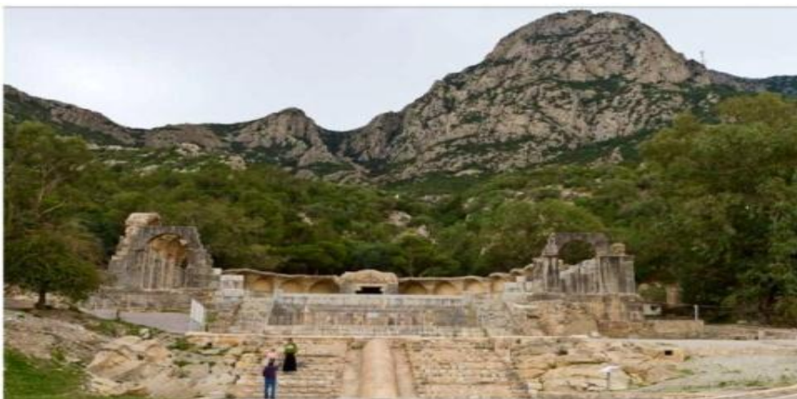
Zaghouan Water temple

To learn about petroleum and mining interest of the region, Barremian-Albian shale oil/gas systems associated or not with hydrothermal systems and mines in the region will be shown.