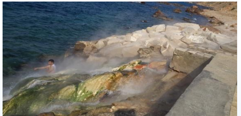
Korbous Thermal Spring