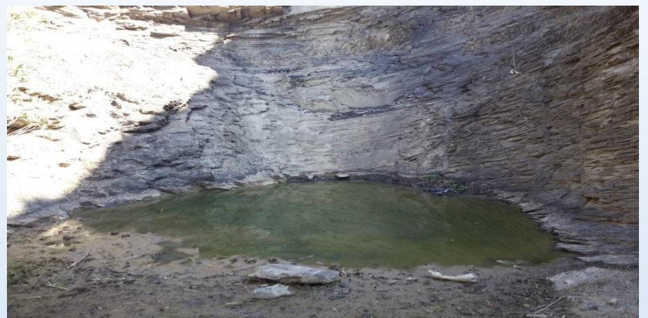
Shale Oil resource system